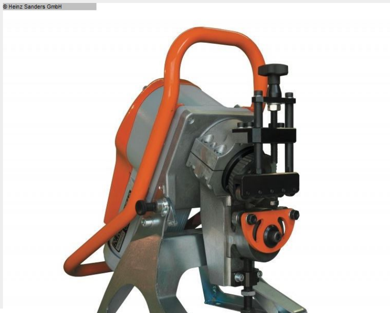
Chamfering system UZ12 ULTRALIGHT - KIT 30° + 45° Maximum bevel width 12 mm with automatic feed

The UZ12 ULTRALIGHT is one of the lightest automatic beveling machines advance in the market. Thanks to its compact size and light weight it is not only suitable for workshops, but also for assemblies. The Machine is equipped with the automatic feed and therefore does this Working with the UZ12 ULTRALIGHT very comfortably.